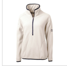
Shell/Navy Blue (LCO00056-SHNV)