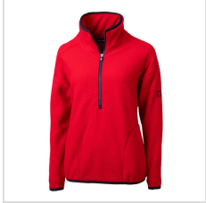
Red/Navy Blue (LCO00056-RDNV)