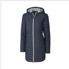
Anthracite Melange (LCO00024-ANM)