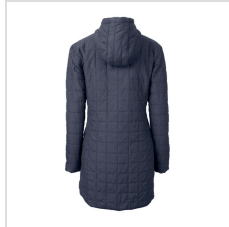
Anthracite Melange (LCO00024-ANM)