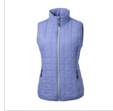
Hyacinth Melange (LCO00008-HYM)