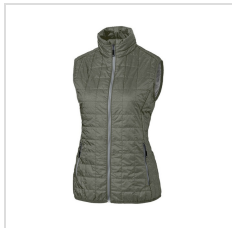
Poplar Melange (LCO00008-POM)