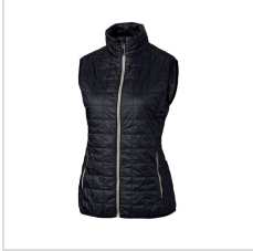
Dark Navy/Silver (LCO00008-DNSV)