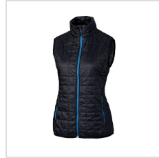
Dark Navy (LCO00008-DN)