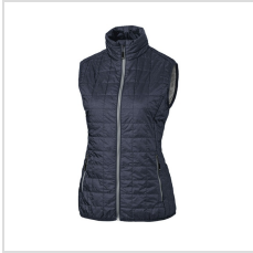
Anthracite Melange (LCO00008-ANM)