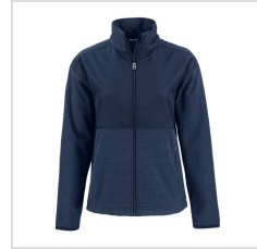
Navy Blue (LCK00230-NVBU)