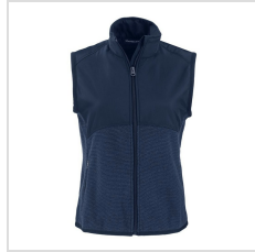
Navy Blue (LCK00228-NVBU)