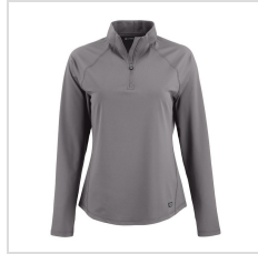
Elemental Grey (LCK00225-EG)