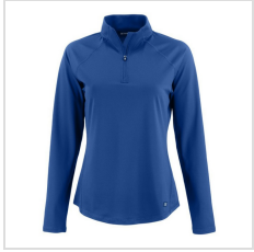
Tour Blue (LCK00225-TBL)