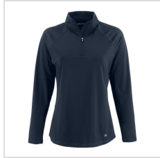
Navy Blue (LCK00225-NVBU)