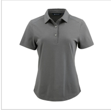
Elemental Grey (LCK00221-EG)