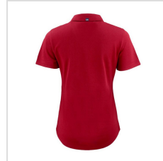
Cardinal Red (LCK00221-CDR)