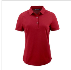
Cardinal Red (LCK00221-CDR)