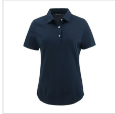
Liberty Navy (LCK00221-LYN)