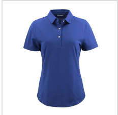
Tour Blue (LCK00221-TBL)