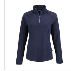
Navy Blue (LCK00210-NVBU)