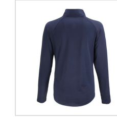
Navy Blue (LCK00210-NVBU)