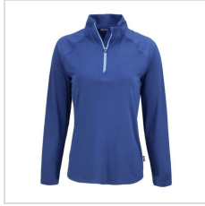
Tour Blue (LCK00210-TBL)