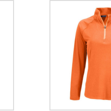
College Orange (LCK00210-CLO)