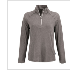
Elemental Grey (LCK00210-EG)