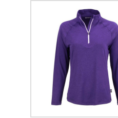
College Purple (LCK00210-CLP)