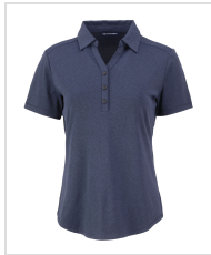
Dark Navy Blue Heather (LCK00199-DNVH)