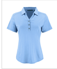
Dark Atlas Heather (LCK00199-DALH)