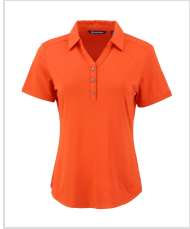
College Orange (LCK00199-CLO)