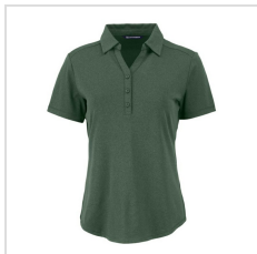
Dark Hunter Heather (LCK00199-DHH)