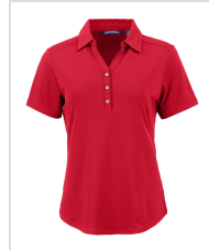
Cardinal Red (LCK00199-CDR)