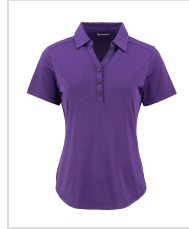
Dark College Purple Heather (LCK00199-DCPH)