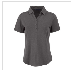
Dark Black Heather (LCK00199-DBLH)