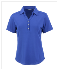
Tour Blue (LCK00199-TBL)