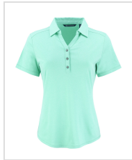
Fresh Mint Heather (LCK00199-FMH)