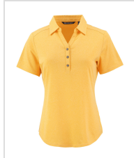
College Gold Heather (LCK00199-CDH)