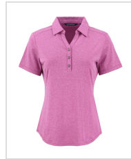
Gelato Heather (LCK00199-GEH)