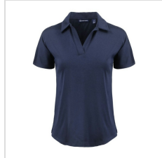
Navy Blue (LCK00193-NVBU)