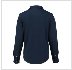
Liberty Navy (LCK00188-LYN)