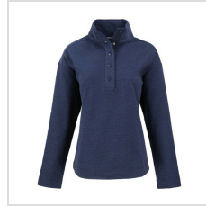
Navy Blue (LCK00180-NVBU)