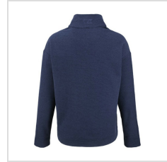
Navy Blue (LCK00180-NVBU)