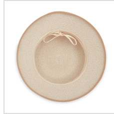
Mixed Camel (LBRT-MC)