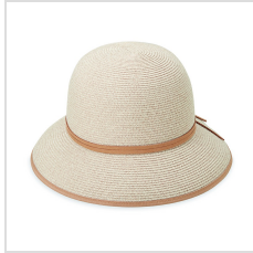
Mixed Camel (LBRT-MC)