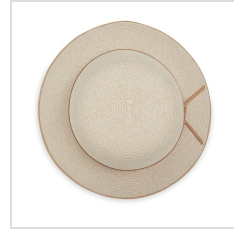
Mixed Camel (LBRT-MC)