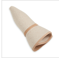
Mixed Camel (LBRT-MC)