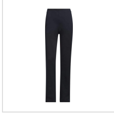
Collegiate Navy (KR3474)