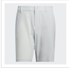
Clear Grey (KF0369)