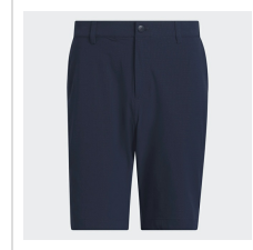
Collegiate Navy (KT4113)