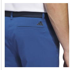
Dusky Petrol (KF0365)