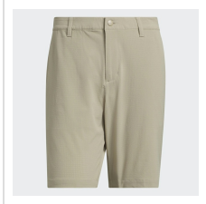
Wonder Cargo (KF0364)