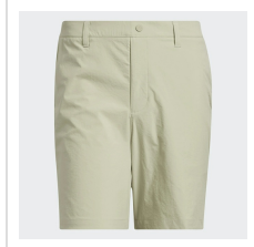
Wonder Cargo (KE9510)