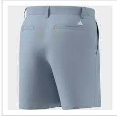
Crystal Sky (KE9511)