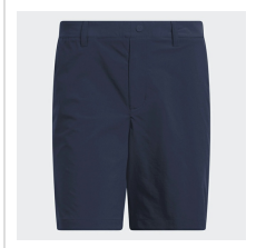
Collegiate Navy (KE9506)