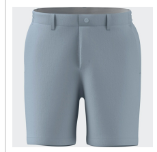
Crystal Sky (KE9511)