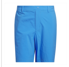
Lucid Ray Blue (KE9507)