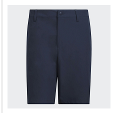
Collegiate Navy (KE9498)