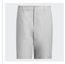
Grey Two (KE9504)