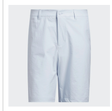
Crystal Sky (KE9503)