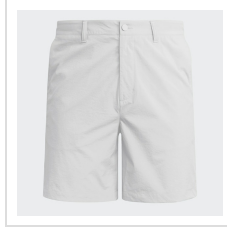
Grey Two (KE9495)