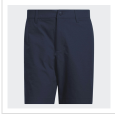
Collegiate Navy (KC4973)