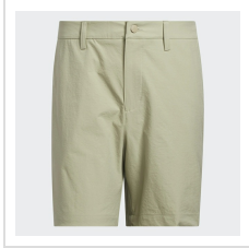
Wonder Cargo (KE9492)