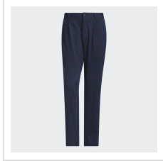
Collegiate Navy (KE9490)