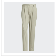
Wonder Cargo (KE9488)