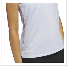
Crystal Sky (KE5306)