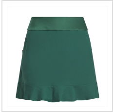
Collegiate Green (KE3634)