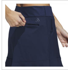
Collegiate Navy (JP0093)