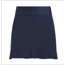
Collegiate Navy (JP0093)