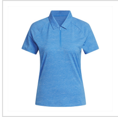
Lucid Ray Blue/Crystal Sky (KC5119)