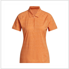
Dusky Orange/White (KC5118)