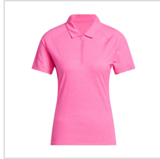
Lucid Pink/Blush Pink (KC1266)