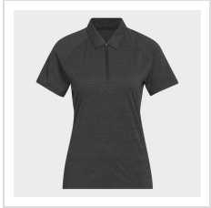
Black/Grey Four (JP0099)