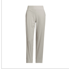
Wonder Alumina (JX6698)