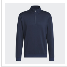
Collegiate Navy (JY5241)