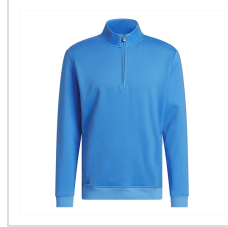
Lucid Ray Blue (KC1119)