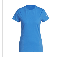
Lucid Ray Blue (KB6215)