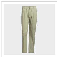
Wonder Cargo (KB5708)