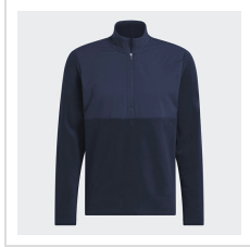
Collegiate Navy (KA9875)