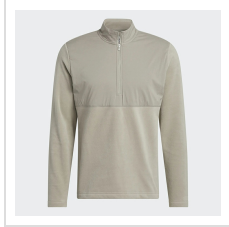
Putty Beige (KA9873)