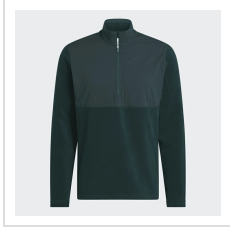
Aurora Ivy (KA9872)