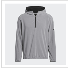
Grey Three/Black (KA7946)