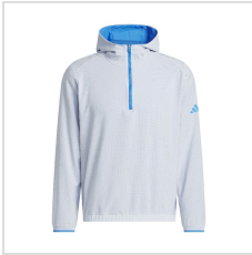
Crystal Sky/Lucid Ray Blue (JZ0542)