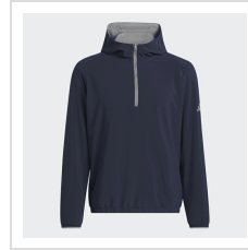
Collegiate Navy/Grey Three (KB2870)