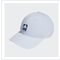
Crystal Sky (JZ2901)