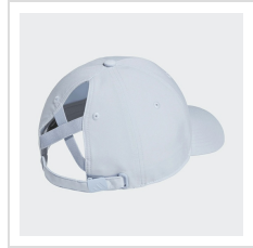
Crystal Sky (JZ2901)