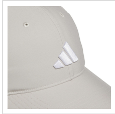
Wonder Alumina (JZ0462)