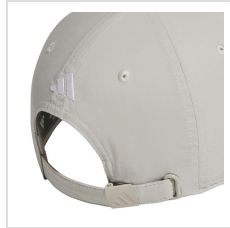
Wonder Alumina (JZ0462)