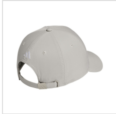
Wonder Alumina (JZ0462)