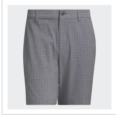
Grey Five (JY5333)