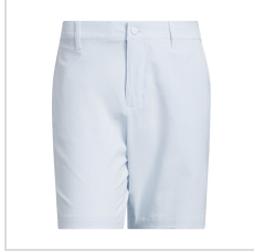
Crystal Sky (JY5330)