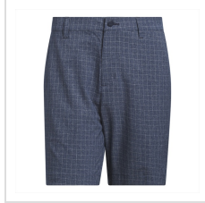
Collegiate Navy (KC1125)