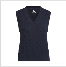
adidas Ladies Collegiate Navy (JX6755)