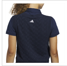
adidas Ladies Collegiate Navy (JX6755)