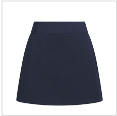
Collegiate Navy (KB9373)