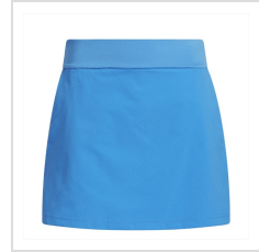
Lucid Ray Blue (KB9375)