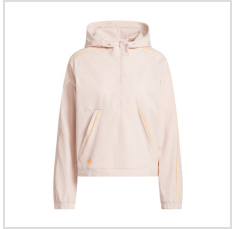
Blush Pink (JX6667)