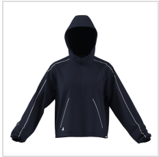
Collegiate Navy (KE3666)