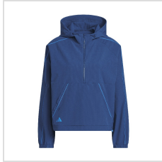
Dusty Petrol (JX6668)