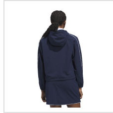
Collegiate Navy (KE3666)