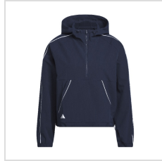
Collegiate Navy (KE3666)