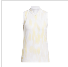
Semi Ice Tangerine (JX6648)