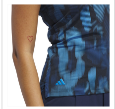
Lucid Ray Blue (JX6649)