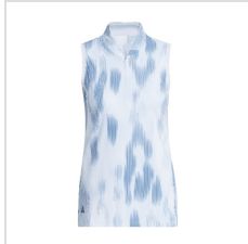
Dusky Petrol (KE3643)