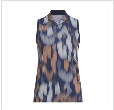
Collegiate Navy (KE3642)