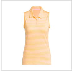
Semi Ice Tangerine (JX6645)