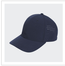
Collegiate Navy (JX4715)