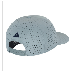
Wonder Sage (KF0767)