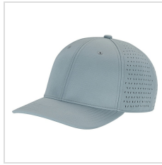
Wonder Sage (KF0767)