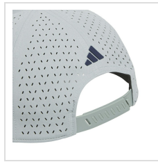
Wonder Sage (KB9378)