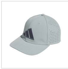
Wonder Sage (KB9378)