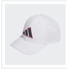
White/Collegiate Navy/Red (JZ5658)