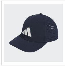
Collegiate Navy (JN1503)