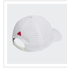
White/Collegiate Navy/Red (JZ5658)