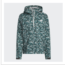
Preloved Teal (JL5705)