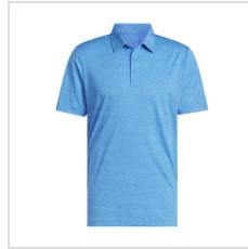
Lucid Ray Blue/Crystal Sky (KC7380)