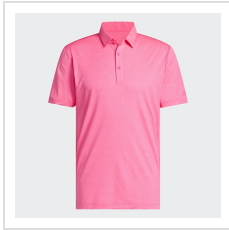
Lucid Pink (KT4114)