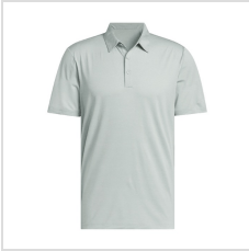
Wonder Sage/Wonder Alumina (JZ0494)