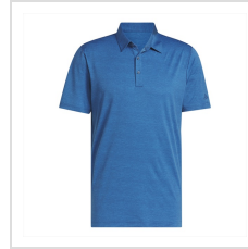
Dusky Petrol/Lucid Ray Blue (KC7379)