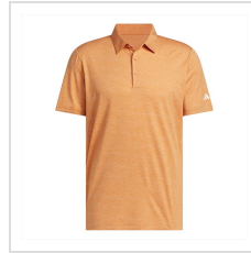
Dusky Orange/White (JZ0493)