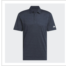
Collegiate Navy/Grey Four (JF4885)