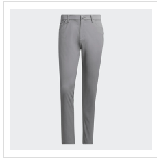
Grey Three (IW0198)