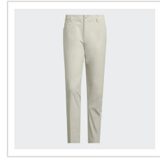
Wonder Alumina (KB9278)