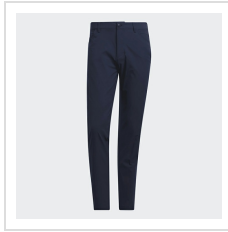
Collegiate Navy (IW0200)