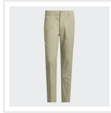
Wonder Cargo (KB9279)