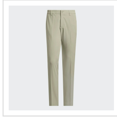
Wonder Cargo (KB9276)