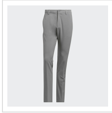
Grey Three (IL0578)