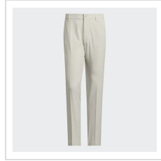
Wonder Alumina (KB9274)