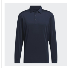
Collegiate Navy (IT7211)