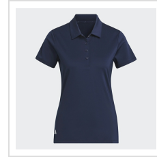
Collegiate Navy (IY5340)