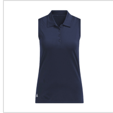
Collegiate Navy (IW1994)