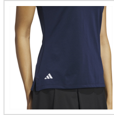
Collegiate Navy (IW1994)