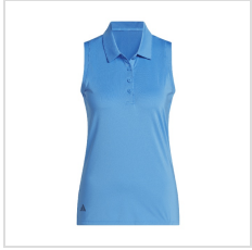
Lucid Ray Blue (KC5129)