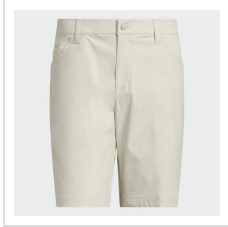
Wonder Alumina (KB9280)