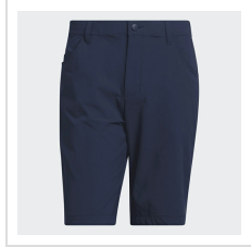
Collegiate Navy (IK2990)