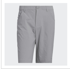
Grey Three (IK2988)