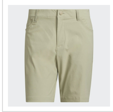
Wonder Cargo (KB9281)