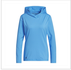
Lucid Ray Blue (KB5870)