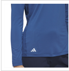
Dusky Petrol (KB5869)