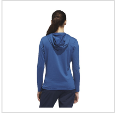
Dusky Petrol (KB5869)