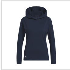
Collegiate Navy (HT1273)