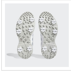
White/Silver Metallic/Blue Fusion (HQ1198)