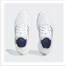
White/Silver Metallic/Blue Fusion (HQ1198)