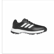
Core Black/White/Silver Metallic (HQ1201)