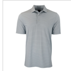
Shark Grey (GNS3K485-SHK)