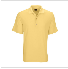
Core Yellow (GNS3K440-CYL)